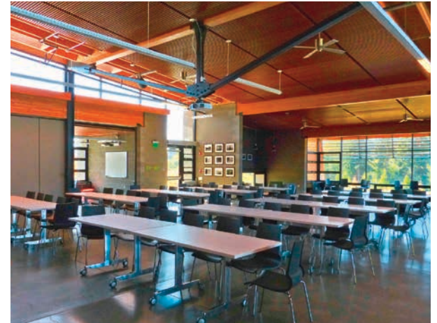
Top: North plaza; Above: Community Room